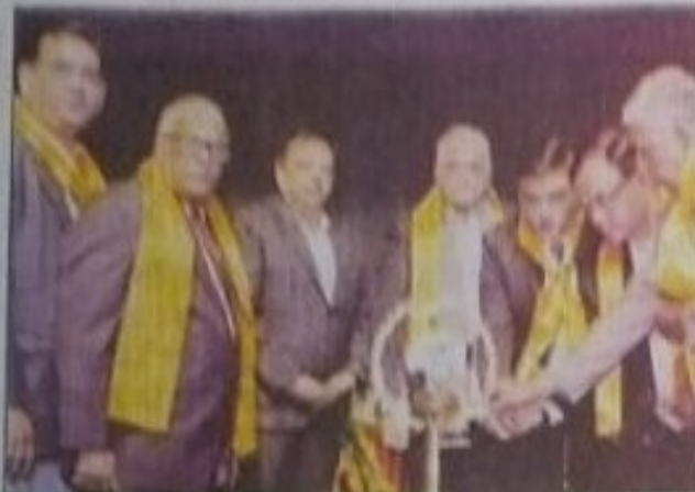
कार्यक्रम का दीपजलाकर शुभारंभ करते मुख्य अतिथि व अन्य।

कानपुर, 18 दिसम्बर: जीएसटी के 8 वर्ष पारित होने के बावजूद अभी भी विभाग एवं कारोबारियों के मध्य विवाद समाप्त नहीं हो पा रहे हैं। इसलिये कारोबारी ईज ऑफ ड्रूइंग बिजनेस का एहसास नहीं कर पा रहा है। वस्तुओं के कर की दरों के बर्गीकरण में