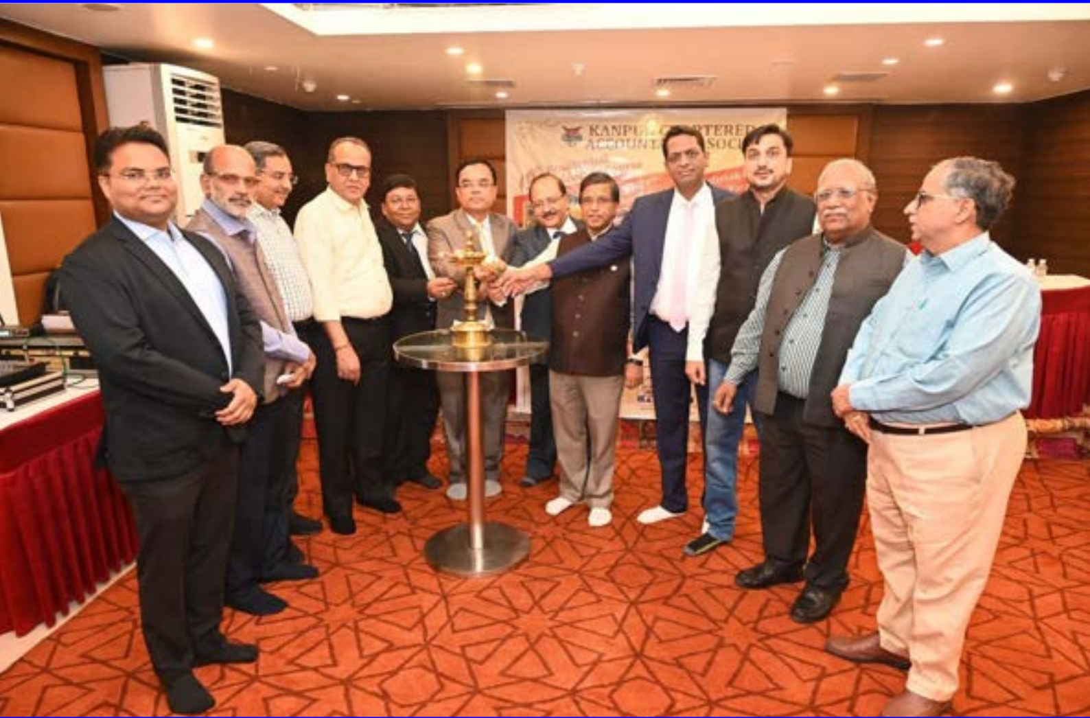
Lighting of Lamp of Inaguration session of 19th RRC, held at Radisson Hotel, Varanasi