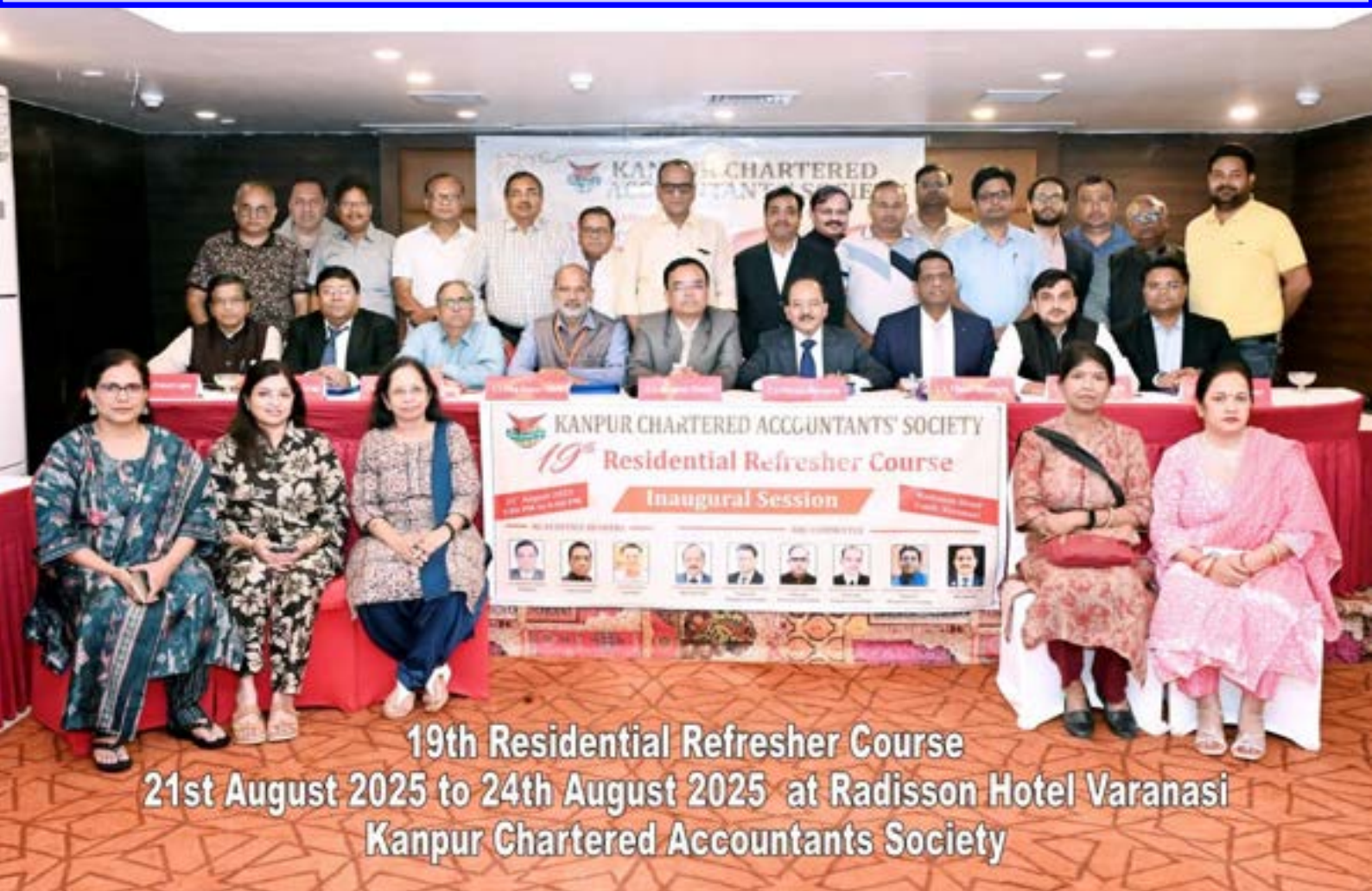
19th Residential Refresher Course 21st August 2025 to 24th August 2025 at Radisson Hotel Varanasi Kanpur Chartered Accountants Society